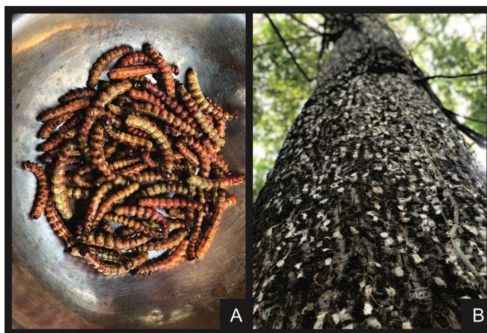
Fig. 3 Lusura altrix (mã-neg) caterpillars: (a) ready for consumption, (b) caterpillar pupa laying on a Brazil nut trunk ( Bertolletia excelsa ).

regarded as Brazil nut tree pests by non-indigenous extractivist communities in the Amazon, but are considered delicacies by the Surui Paiter (Coimbra Jr, 2012). The removal of the caterpillars from Brazil nut trees for consumption may be directly influencing populations of Brazil nut trees.