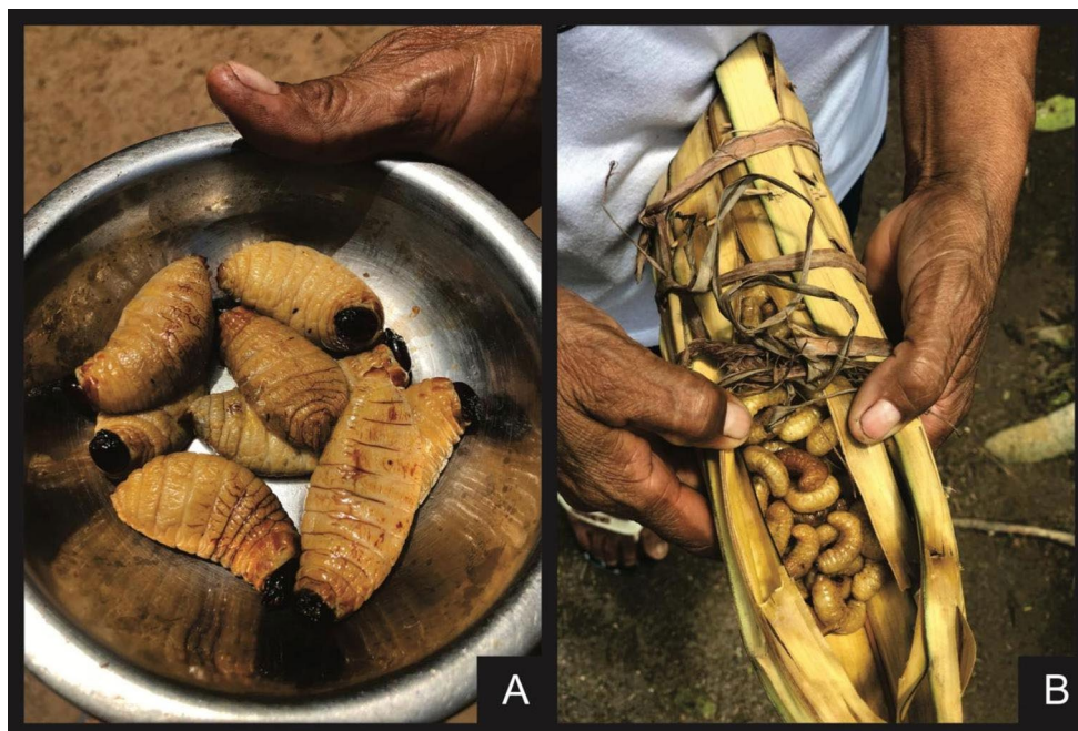
Fig. 2 Edible beetle larvae consumed as food by the Paiter Suruí: (a) Rhynchophorus palmarum larvae ( mãyõrã ) and (b) Pachymerus cardo larvae ( kadeg ).

During our field observations, only jaracatiá trees were cut to attract the Curculionidae beetles, although gathering of mãyõrã larvae also occurred with different palms. The jaracatiá trees were felled with a chainsaw and split lengthwise, leaving the internal wood in contact with the ground. According to our volunteers, this modification of